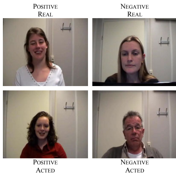
Figure 1: Representative stills of acted (top) and real emotional (bottom) expressions, with on the left hand side the positive and on the right hand side the negative versions.

NEUTRAL, NEGATIVE), two acting conditions were added. In one of these, participants were shown negative sentences and were asked to utter these as if they were in a positive emotion (ACT POSITIVE); in the other, positive sentences were shown and participants were instructed to utter these in a negative way (ACT NEGATIVE). The sentences showed a progression, from neutral (“Today is neither better nor worse than any other day”) to increasingly more emotional sentences (“God I feel great!” and “I want to go to sleep and never wake up.” for the positive and negative sets, respectively), to allow for a gradual build-up of the intended emotional state.